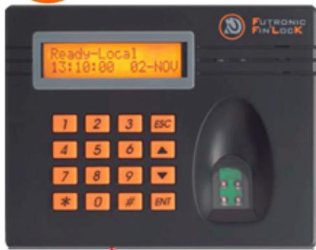
12V DC Power Supply